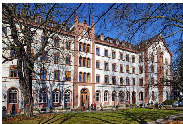
Workshop, accommodation @ Hotel Odelya Missionsstrasse 21, 4055 Basel